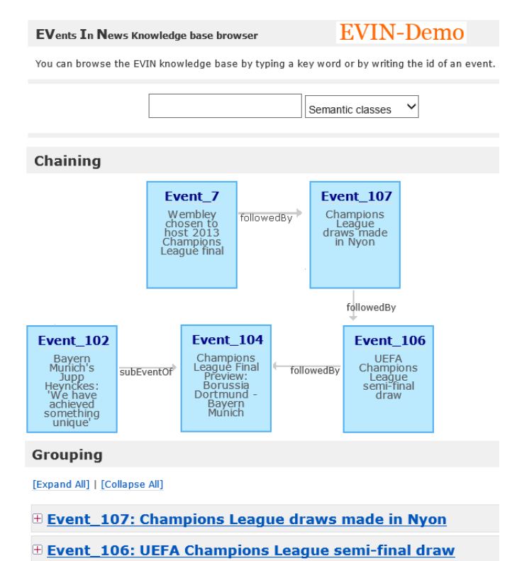
Figure 2: Screenshot of EVIN.

events. Figure 3 shows the grouping of the events and also news headlines as sub-items of the events. Detailed information can be viewed by clicking on items.